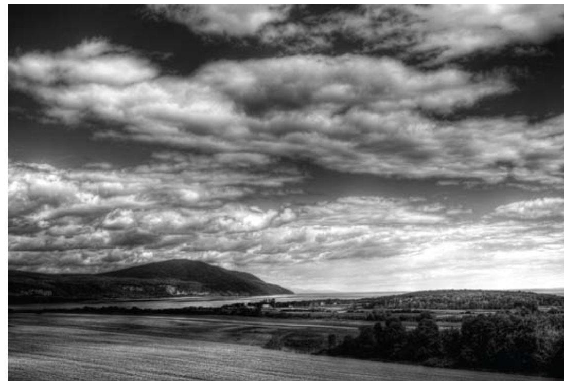
Sight of the coast of Saint-Jean-de-l'Île d'Orléans