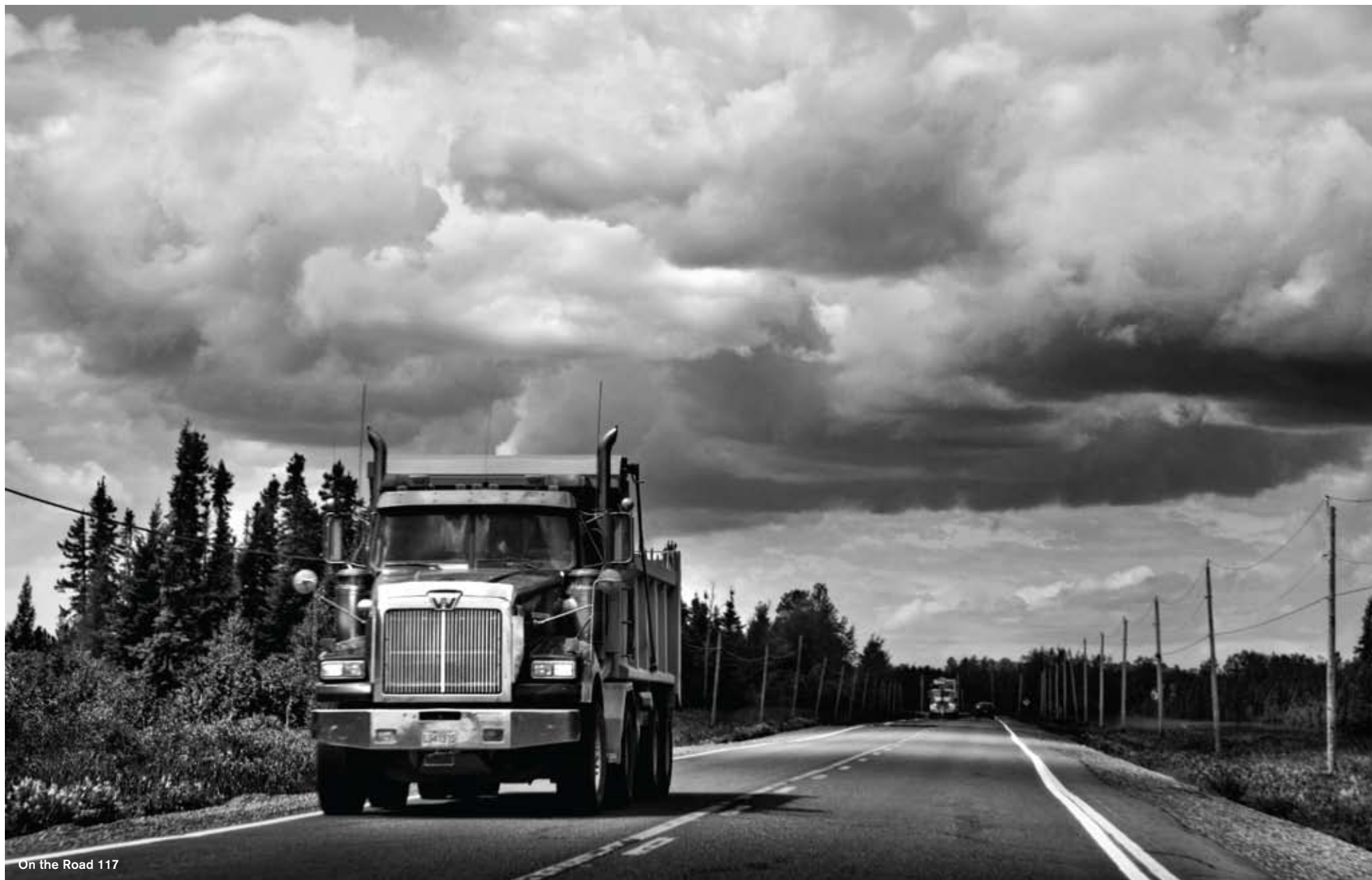
On the Road 117