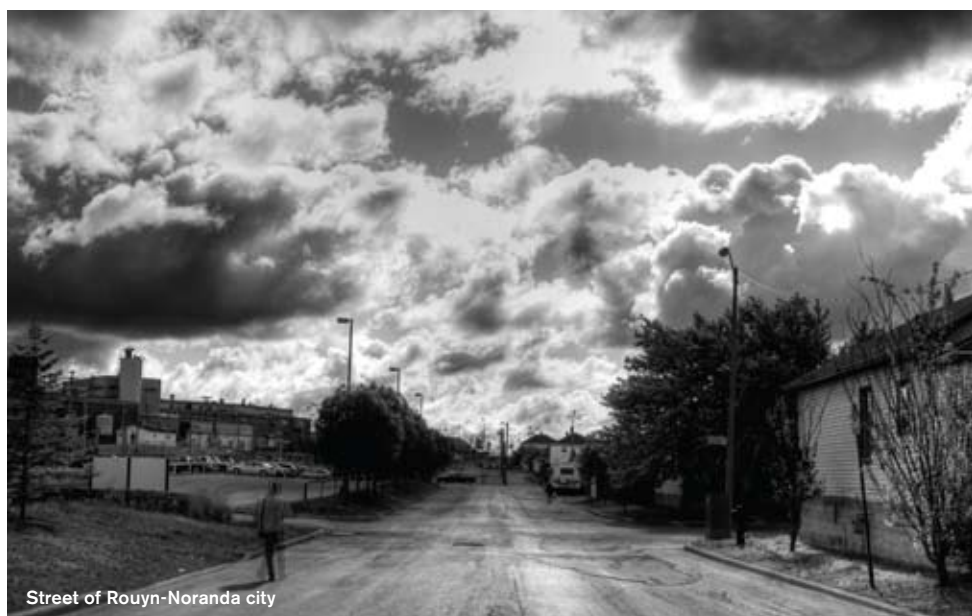
Street of Rouyn-Noranda city