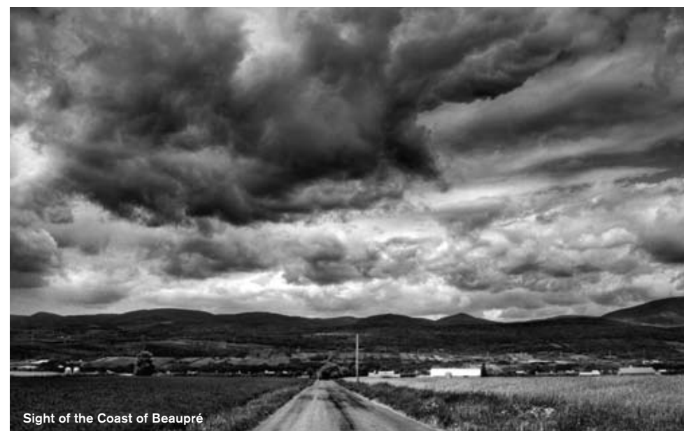
Sight of the Coast of Beaupré