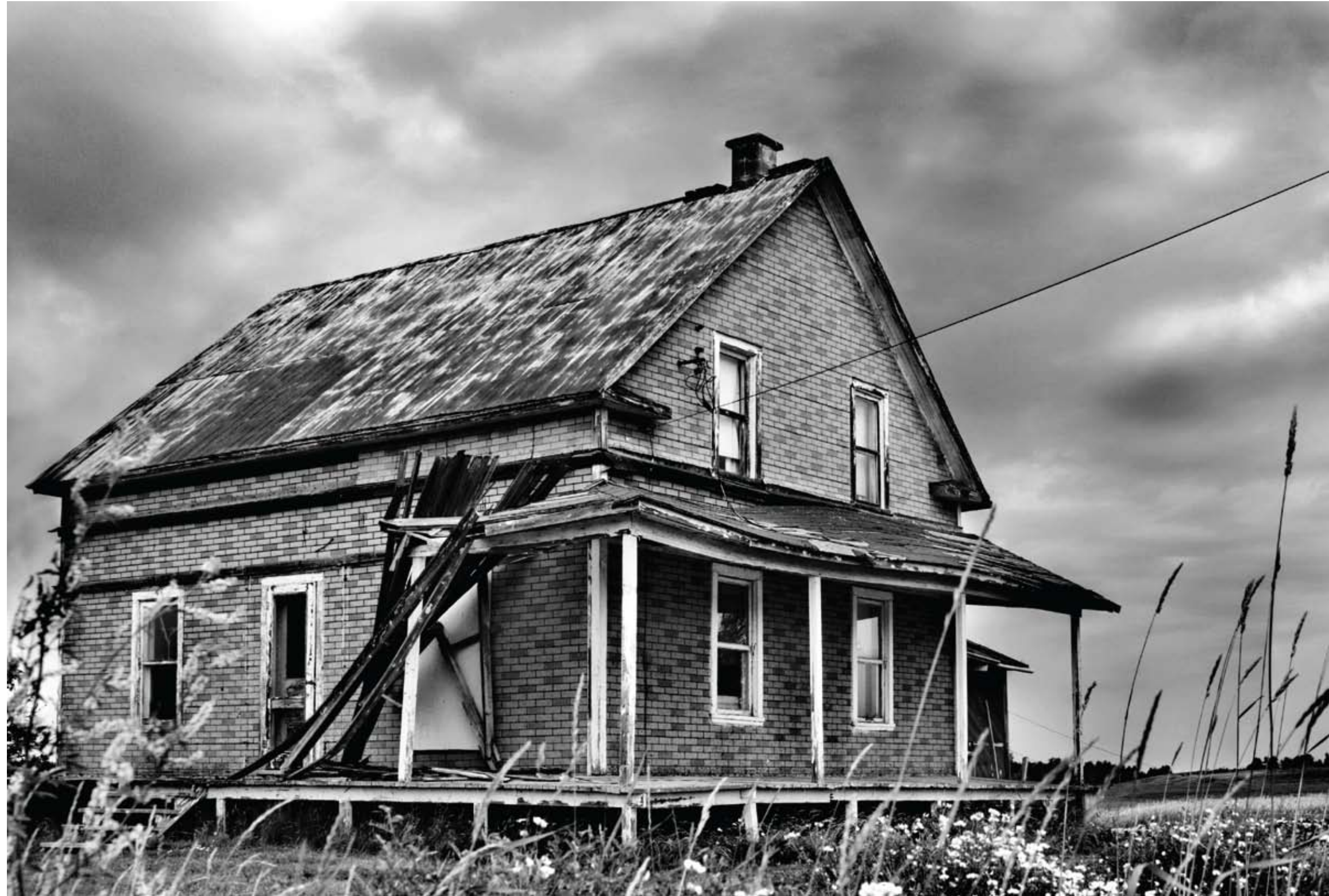
Abandoned house near of Sainte-Germaine-Boulé village