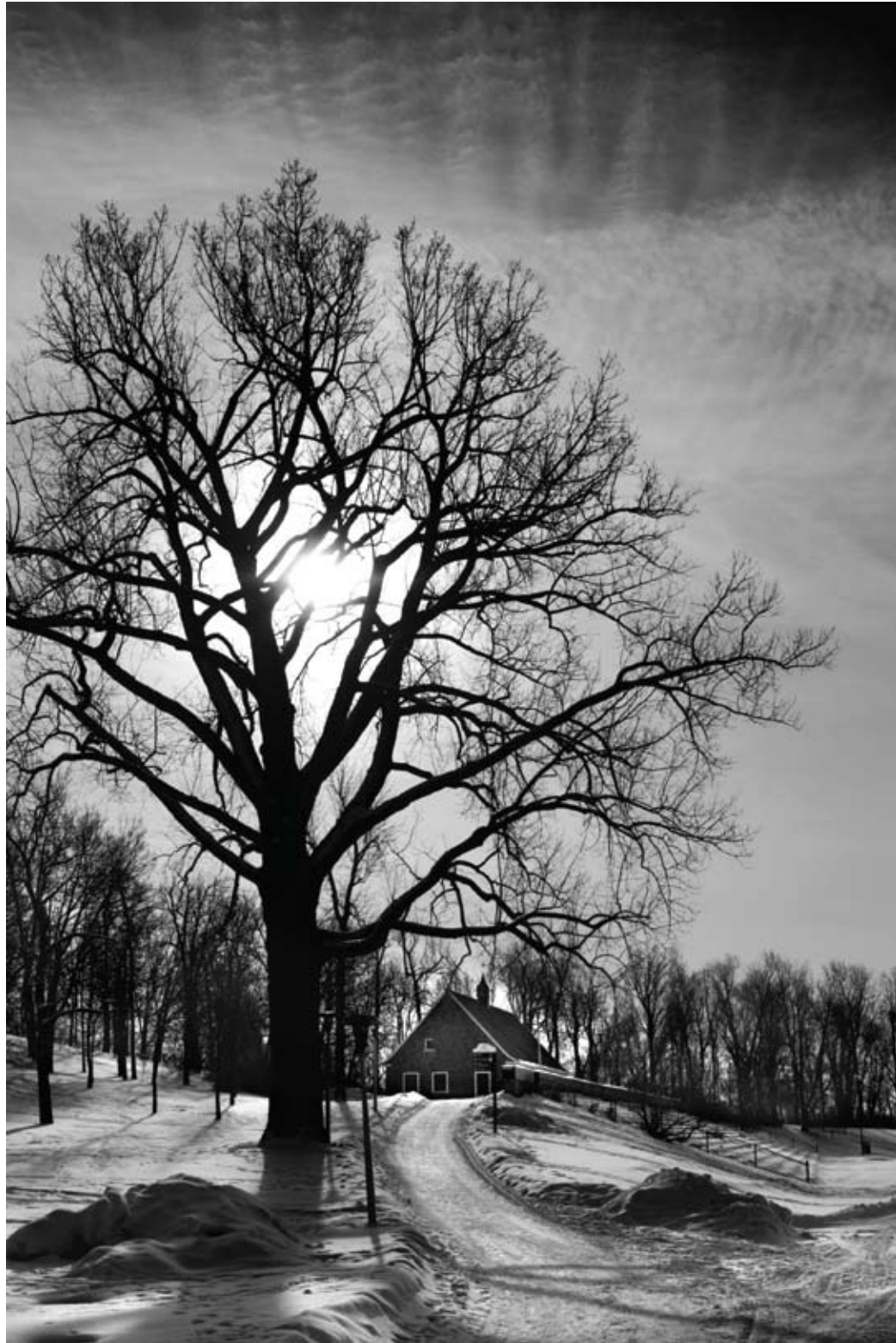
Park Jean Drapeau at Montreal city during the winter