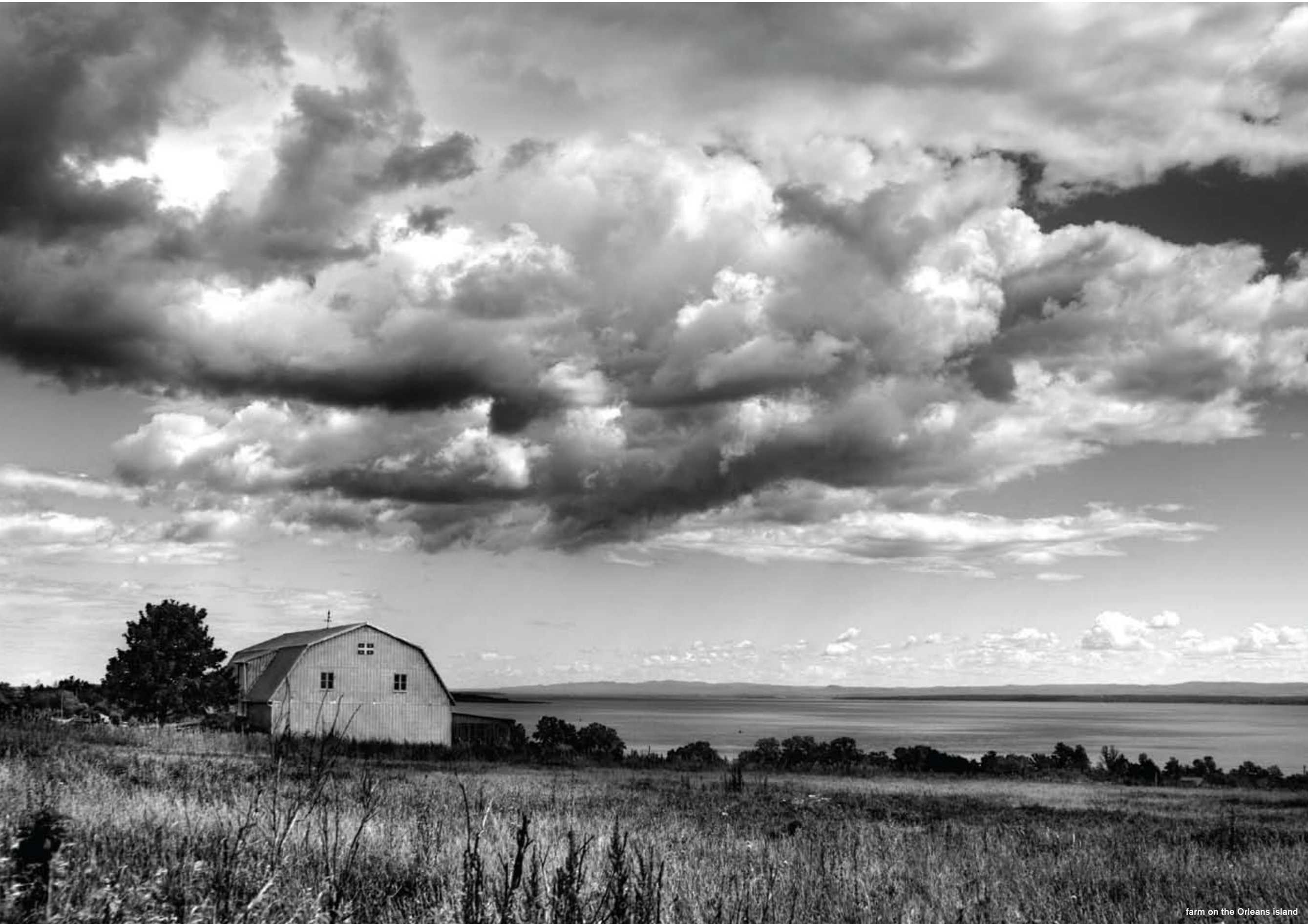
farm on the Orleans island