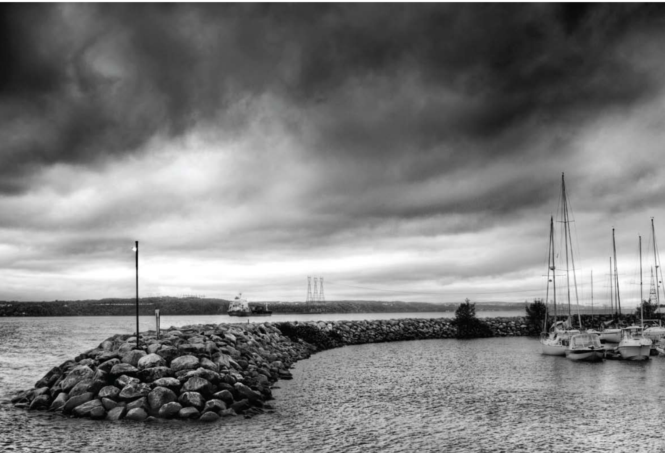
Maritime park of Saint-Laurent-de-l'Île d'Orléans